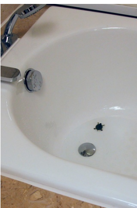
"Turtle on the loose."