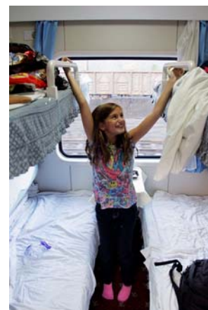
"4 bedroom suite on a Chinese train."

When you buy a first class ticket in China they will put you in the first class coach which for some reason has no windows that will open, keep in mind that in third class you could jump outside the windows open so wide. Then the highly intelligent train manager will put the smoking car in front of your car so all night you get a fresh supply of cigarette smoke and not any smoke but Chinese cigarette smoke.