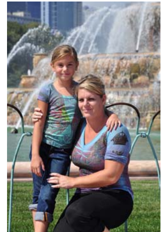
“The girls posing in front of Buckingham Fountain in Grant Park.”